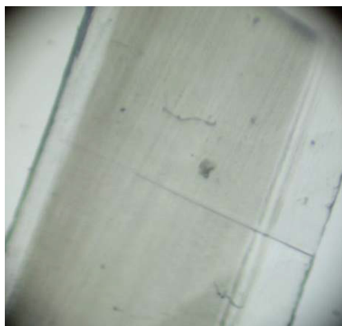
Figure 1. Juice bottle laminate examined using the FTIR microscope, visually, you can identify at least 4 layers in this image.

Analysis was performed using a JASCO FT/IR-620 and IRT-30 FT-IR microscope with a ceramic source, KBr beamsplitter, and MCT detector. The resolution was 4 \text{cm}^{-1} , with 64 co-added scans for the single-beam background and sample spectra. The spectral range was from 4000-700 \text{cm}^{-1} .