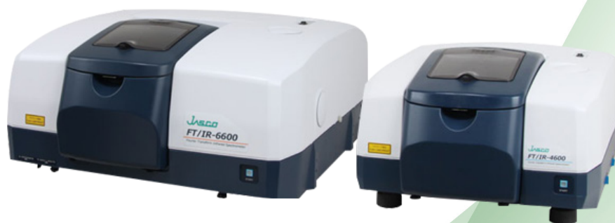
JASCO FT-IR Spectrometers

Modern polymers are seldom used as pure materials, more often mixtures of different polymers are combined to give the desired physical characteristics. For example, the rigidity of polystyrene is often combined with an elastic polymer to produce stiff yet shock resistant materials. Polymeric laminates are important in the microelectronics, medical, food packaging, and chemical industries. Since laminates act as moisture and/or oxygen barriers, they are commonly used to protect foods and chemicals.