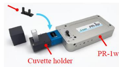
Fig. 1 Cuvette holder attached

Use of the spacer allows the focus position to be the same each time.